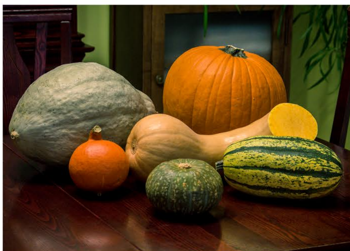
La table au quotidien