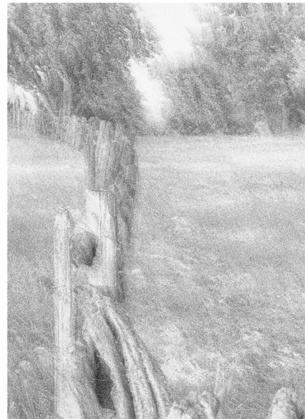
Courbes et lignes du monde rural